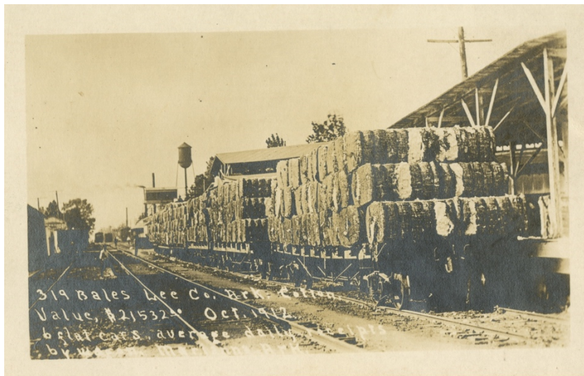
Photo 4: Train cars are loaded with 319 bales of cotton in Lee County, ca. 1910-1920 (Agriculture photograph collection, ca. 1893-1941)