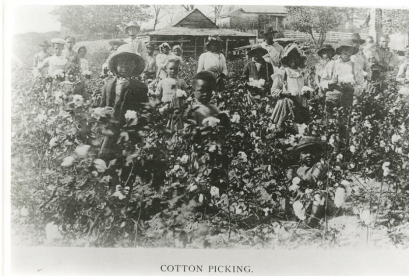
Photo 1: Workers picking cotton, not dated/ca. early 20 th century