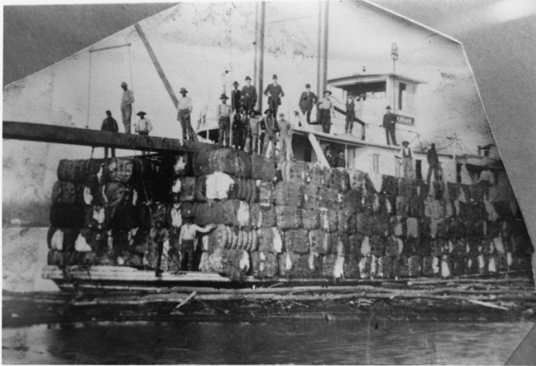
Photo 3: Cotton shipment in Jackson County, ca. 1900 (Rivers, Landings, and Riverboats Photograph Collection, ca. 1880-1927)

CENTER FOR ARKANSAS HISTORY AND CULTURE UNIVERSITY OF ARKANSAS AT LITTLE ROCK