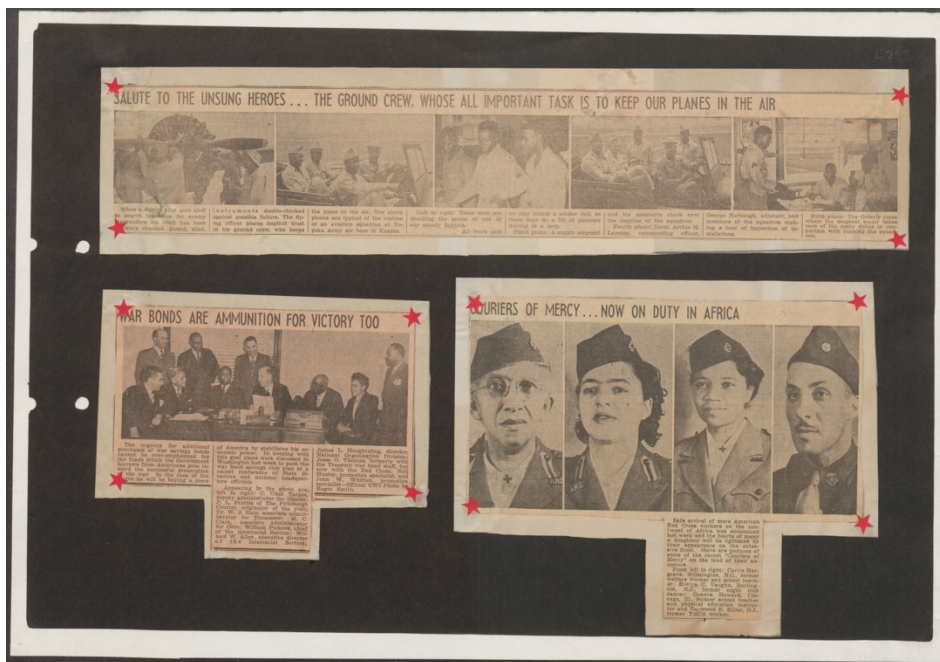
"Negro History Scrapbook," ca. 1944 (National Dunbar Alumni Association Historical Collection), p. 73