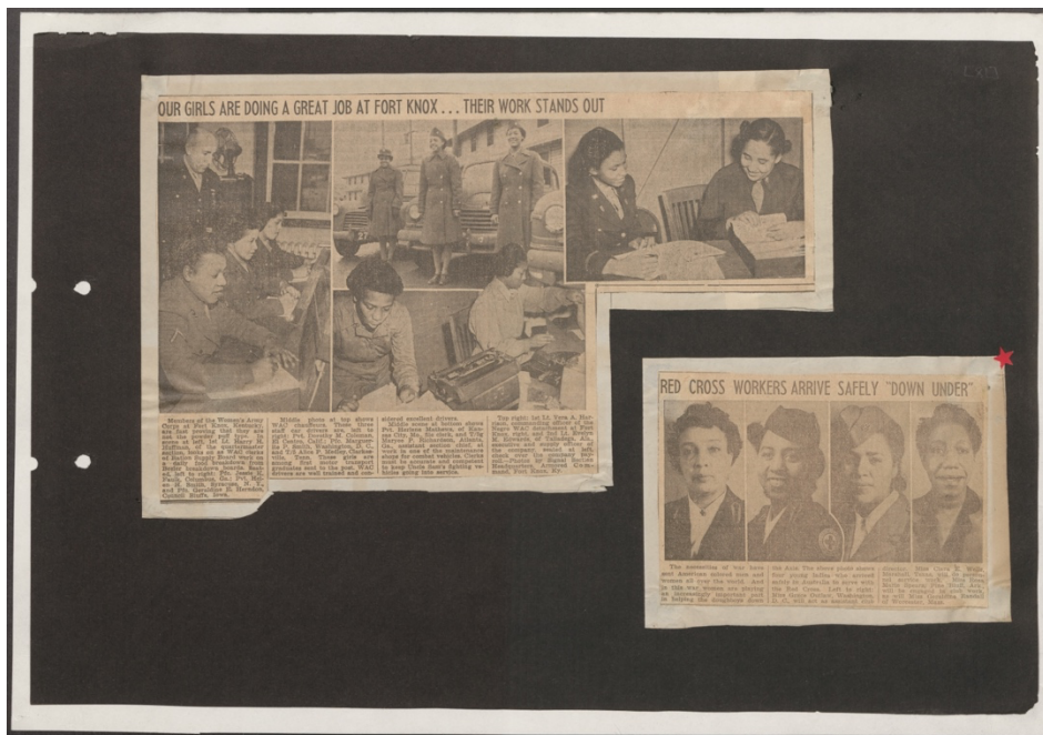
“Negro History Scrapbook,” ca. 1944 (National Dunbar Alumni Association Historical Collection), p. 75