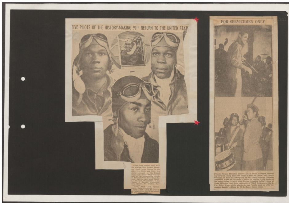
“Negro History Scrapbook,” ca. 1944 (National Dunbar Alumni Association Historical Collection), p. 77