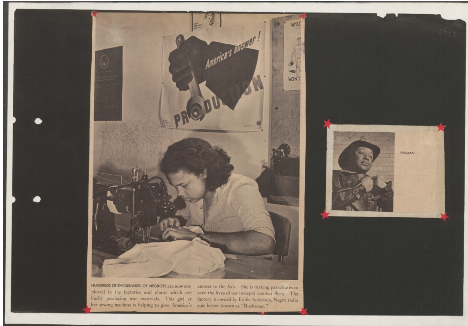
"Negro History Scrapbook," ca. 1944 (National Dunbar Alumni Association Historical Collection), p. 71