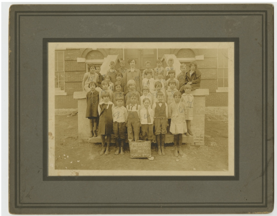
Photo 6: First and second grade class portrait in Huntington, 1926