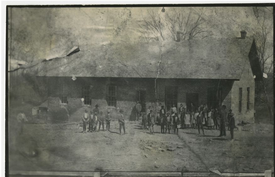
Photo 5: Students stand outside of school for African American children in Fayetteville, Arkansas, not dated, ca. 1870s-1890s