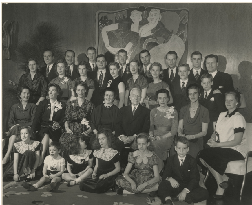
Photo 2: A portrait of the Rockefeller family (extended) gathered at Christmas., 1955