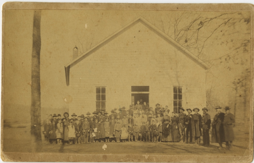
Photo 1: School group probably in Crawford County or Madison County, 1880s (Education Photograph Collection)

CENTER FOR ARKANSAS HISTORY AND CULTURE UNIVERSITY OF ARKANSAS AT LITTLE ROCK