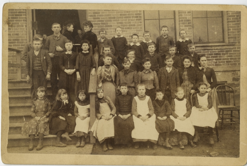
Photo 3: School children at Belle Point School in Fort Smith, 1890-1895

CENTER FOR ARKANSAS HISTORY AND CULTURE UNIVERSITY OF ARKANSAS AT LITTLE ROCK