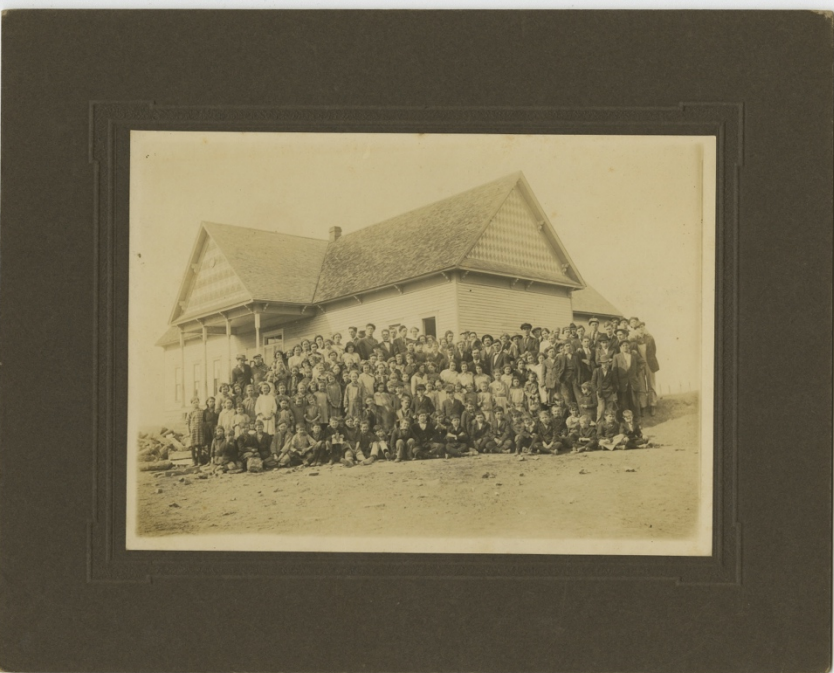
Photo 2: School group in Uniontown, 1910 (Education photograph collection, ca. 1880-1930)