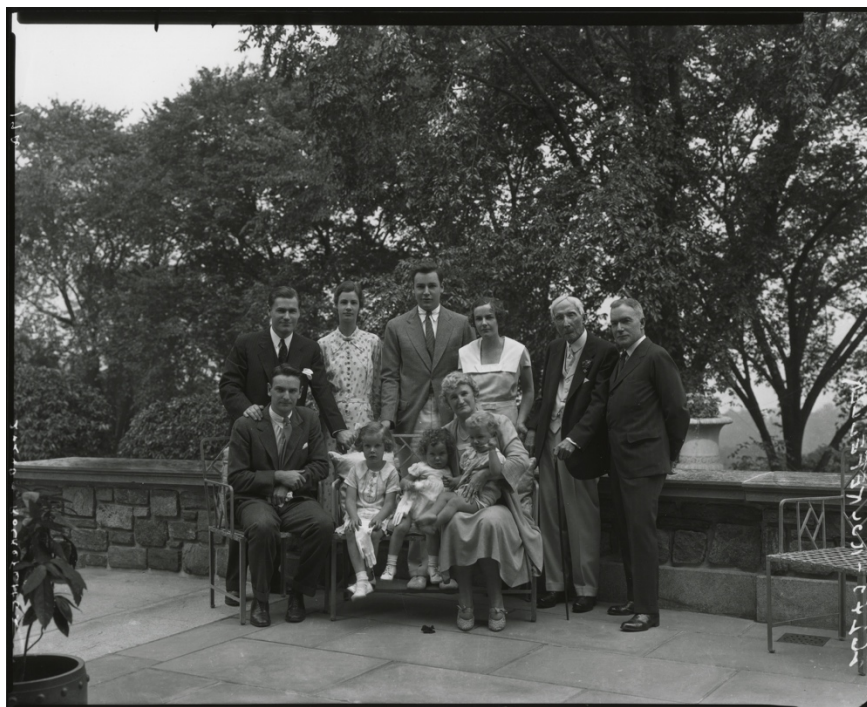
Photo 3: Group portrait of John D. Rockefeller Sr.'s family, ca. 1918-1930s

CENTER FOR ARKANSAS HISTORY AND CULTURE UNIVERSITY OF ARKANSAS AT LITTLE ROCK