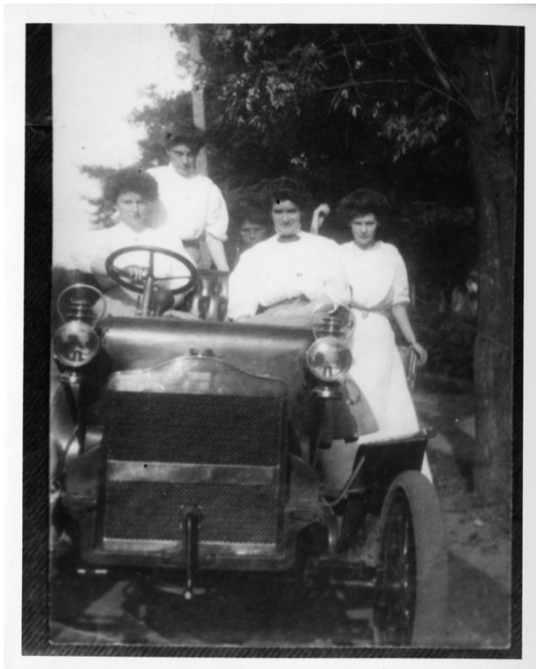
Photo 8: Group of women in a 1907 or 1908 two-cylinder Maxwell automobile, not dated, ca. 1910s