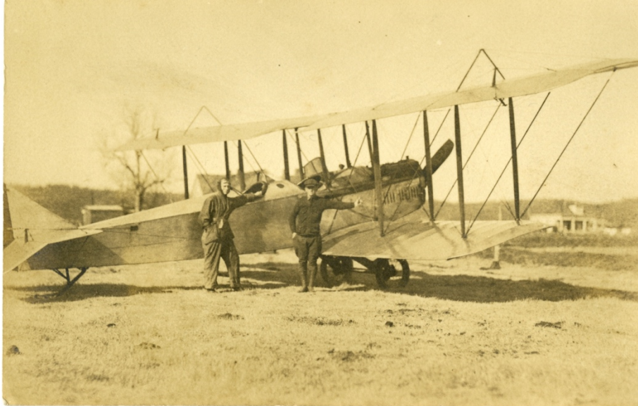
Photo 12: Two men and biplane, not dated, ca. 1910s (Transportation Photograph Collection, ca. 1880-1945)

CENTER FOR ARKANSAS HISTORY AND CULTURE UNIVERSITY OF ARKANSAS AT LITTLE ROCK