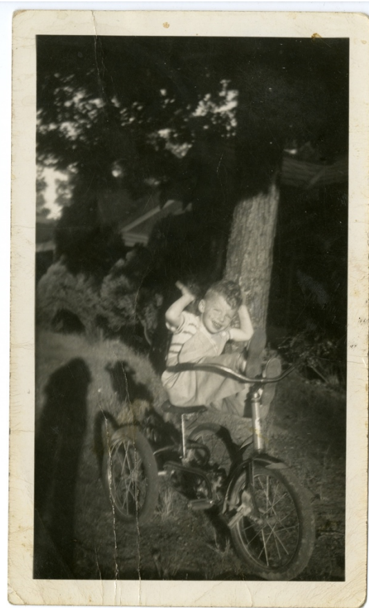
Photo 6: Jim Guy Tucker riding tricycle on Stonewall Road, Little Rock, 1948