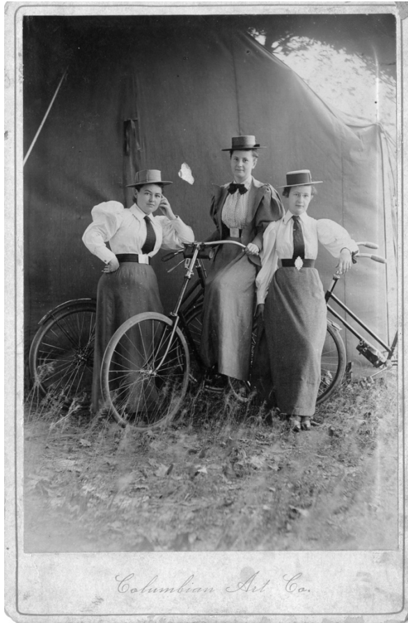
Photo 5: Women cyclists in Forrest City, Arkansas, ca. 1890s (Women in Arkansas photograph collection, ca. 1850s-1980s)

CENTER FOR ARKANSAS HISTORY AND CULTURE UNIVERSITY OF ARKANSAS AT LITTLE ROCK