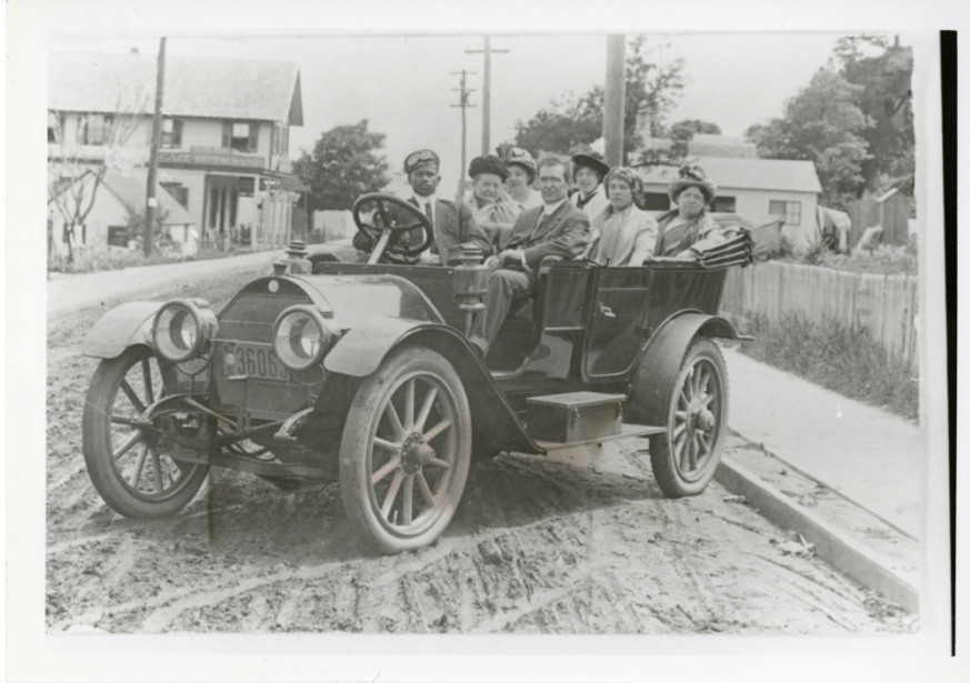
Photo 7: Seven people in automobile, 1900s (Mary Elizabeth Parker Photograph Collection, ca. 1980s-1910s)

CENTER FOR ARKANSAS HISTORY AND CULTURE UNIVERSITY OF ARKANSAS AT LITTLE ROCK