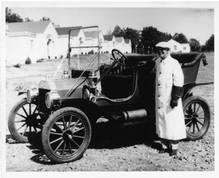
Photo 9: Man in driving clothes next to 1912 Ford Model T automobile at Quail's Motel in Van Buren, not dated, ca. 1910s (Transportation Photograph Collection, ca. 1880-1945)

CENTER FOR ARKANSAS HISTORY AND CULTURE UNIVERSITY OF ARKANSAS AT LITTLE ROCK