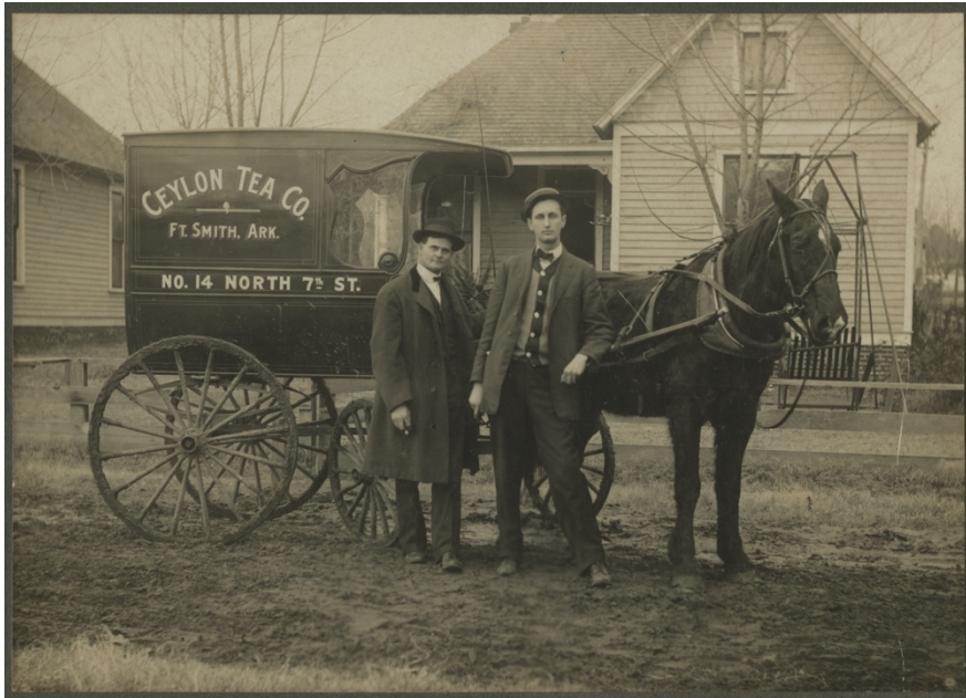
Photo 3: Delivery wagon for the Ceylon Tea Company sits outside house in Fort Smith, ca. 1900

CENTER FOR ARKANSAS HISTORY AND CULTURE UNIVERSITY OF ARKANSAS AT LITTLE ROCK