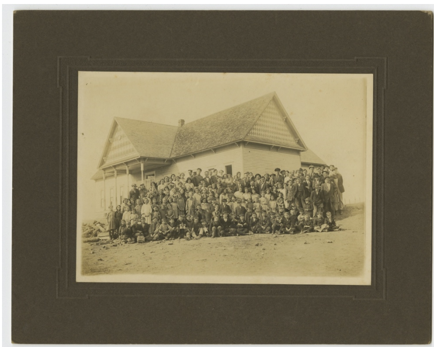
Photo 2: School group in Uniontown, 1910 (Education photograph collection, ca. 1880-1930)