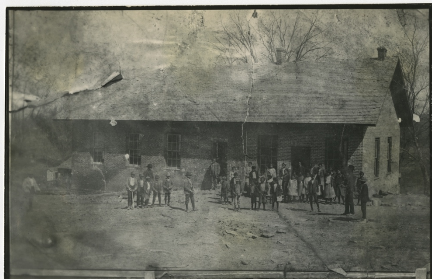
Photo 5: Students stand outside of school for African American children in Fayetteville, Arkansas, not dated, ca. 1870s-1890s