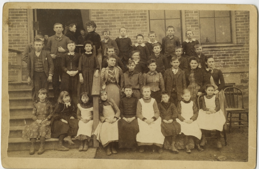
Photo 3: School children at Belle Point School in Fort Smith, 1890-1895 (Education photograph collection, ca. 1880-1930)

CENTER FOR ARKANSAS HISTORY AND CULTURE UNIVERSITY OF ARKANSAS AT LITTLE ROCK