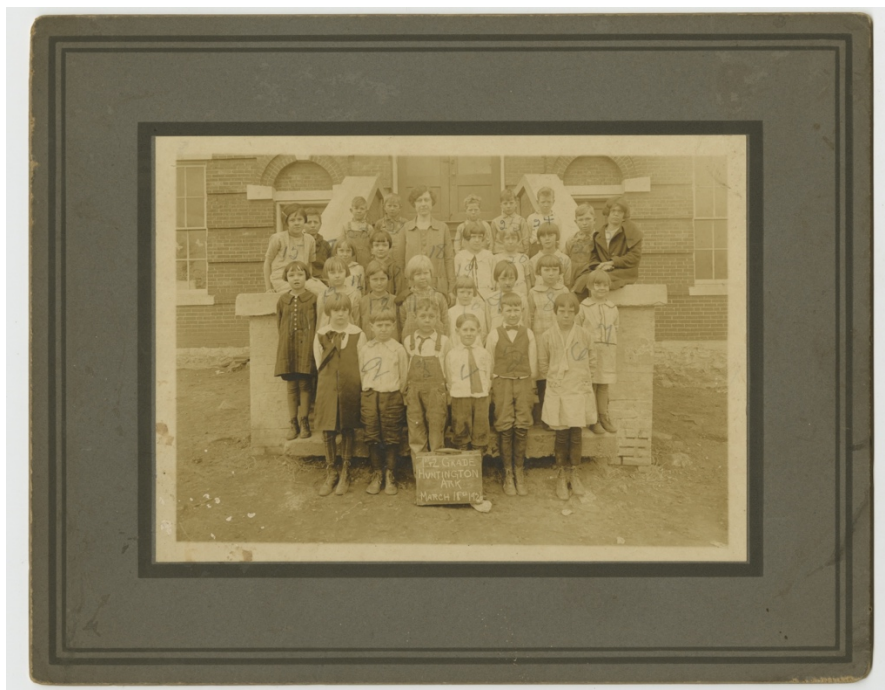
Photo 6: First and second grade class portrait in Huntington, 1926