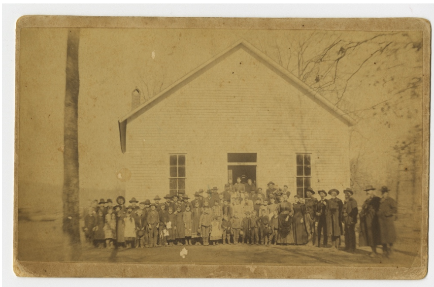
Photo 1: School group probably in Crawford County or Madison County, 1880s