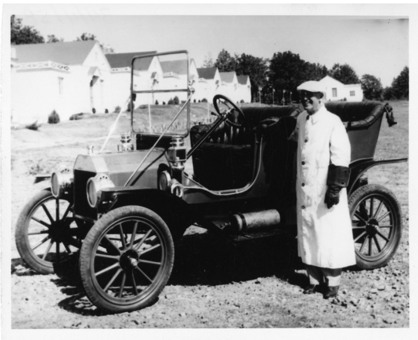
Photo 9: Man in driving clothes next to 1912 Ford Model T automobile at Quail's Motel in Van Buren, not dated, ca. 1910s (Transportation Photograph Collection, ca. 1880-1945)

CENTER FOR ARKANSAS HISTORY AND CULTURE UNIVERSITY OF ARKANSAS AT LITTLE ROCK