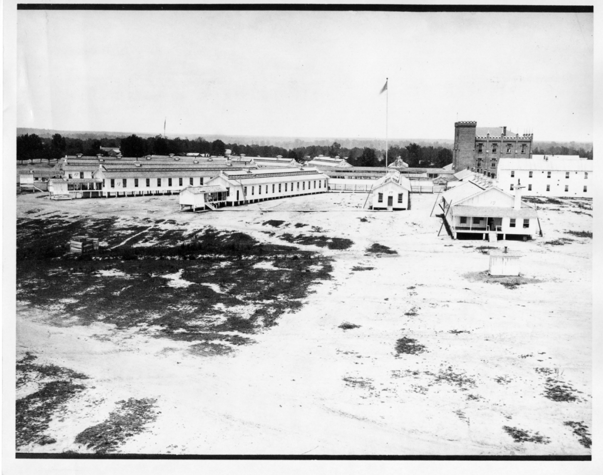
A hospital complex in Little Rock during the Civil War in what is today the MacArthur Park, 1864

CENTER FOR ARKANSAS HISTORY AND CULTURE UNIVERSITY OF ARKANSAS AT LITTLE ROCK