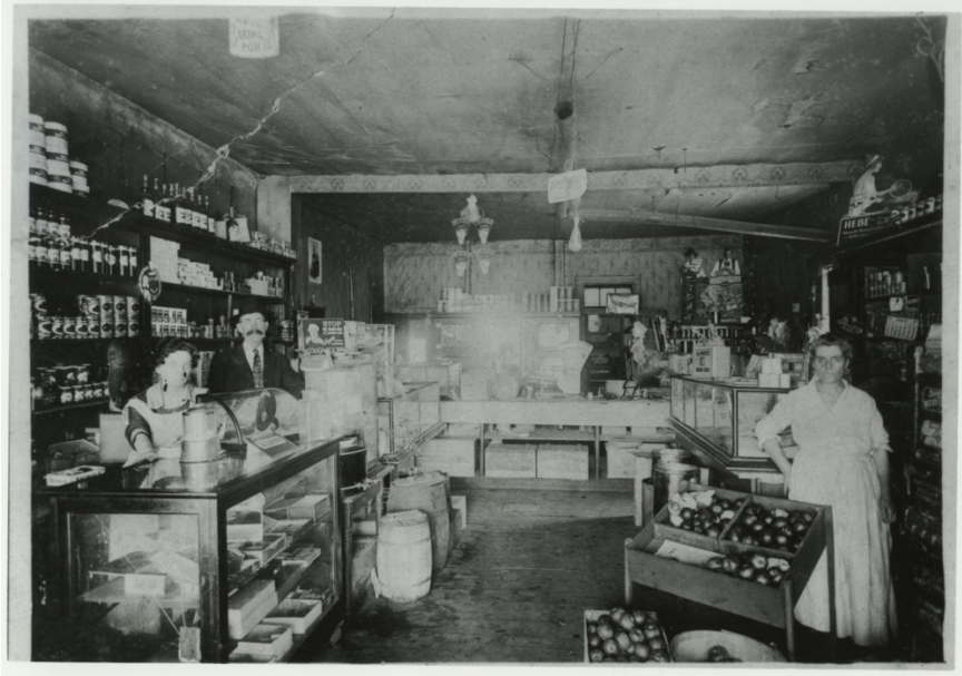
Photo 6: Grocery store in Arkansas, 1917 (Business and Industry photograph collection, ca. 1860s-1970s)

CENTER FOR ARKANSAS HISTORY AND CULTURE UNIVERSITY OF ARKANSAS AT LITTLE ROCK