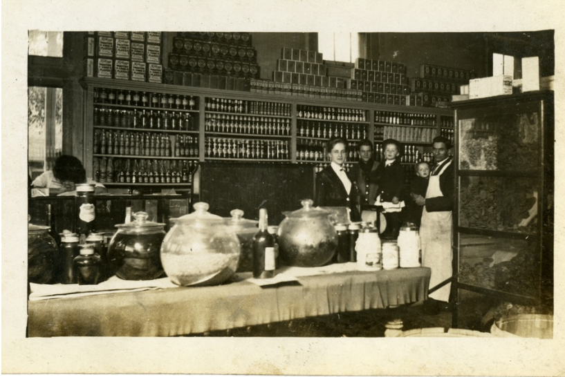
Photo 4: Workers and children pose together at an unidentified grocery store in Little Rock, ca. 1912-1913