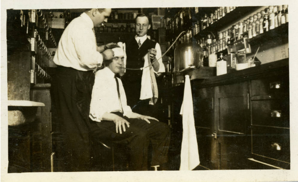
Photo 3: Workers treat a customer inside a pharmacy in Little Rock, ca. 1912-1913

CENTER FOR ARKANSAS HISTORY AND CULTURE UNIVERSITY OF ARKANSAS AT LITTLE ROCK