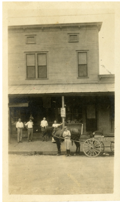
Photo 5: Grocery store at 4200 12th Street in Little Rock, 1916