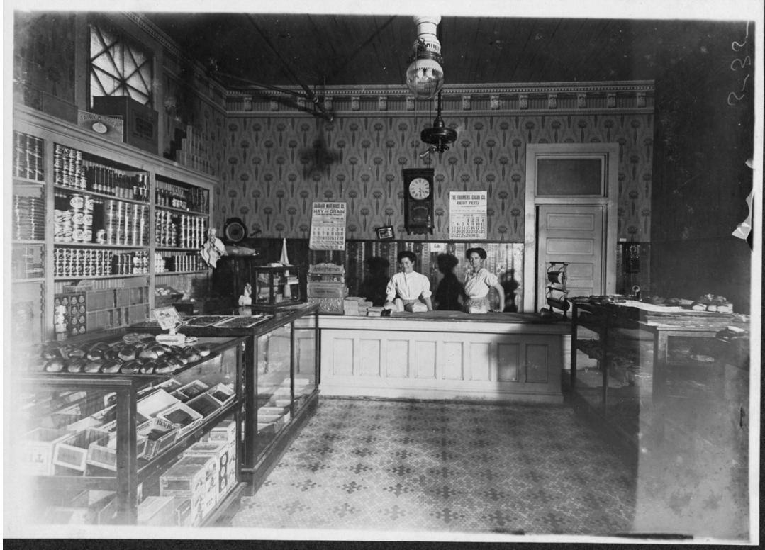
Photo 1: Hills Bakery interior in Little Rock, ca. 1900 (Little Rock Scenes II photograph collection, ca. 1861-1970s)

CENTER FOR ARKANSAS HISTORY AND CULTURE UNIVERSITY OF ARKANSAS AT LITTLE ROCK