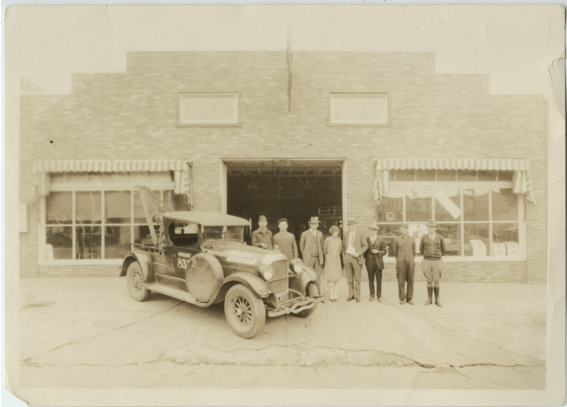
Photo 5: Employees pose in front of Cates Motor Service in Fort Smith, ca. 1930s (Business and Industry photograph collection, ca. 1860s-1970s)

CENTER FOR ARKANSAS HISTORY AND CULTURE UNIVERSITY OF ARKANSAS AT LITTLE ROCK