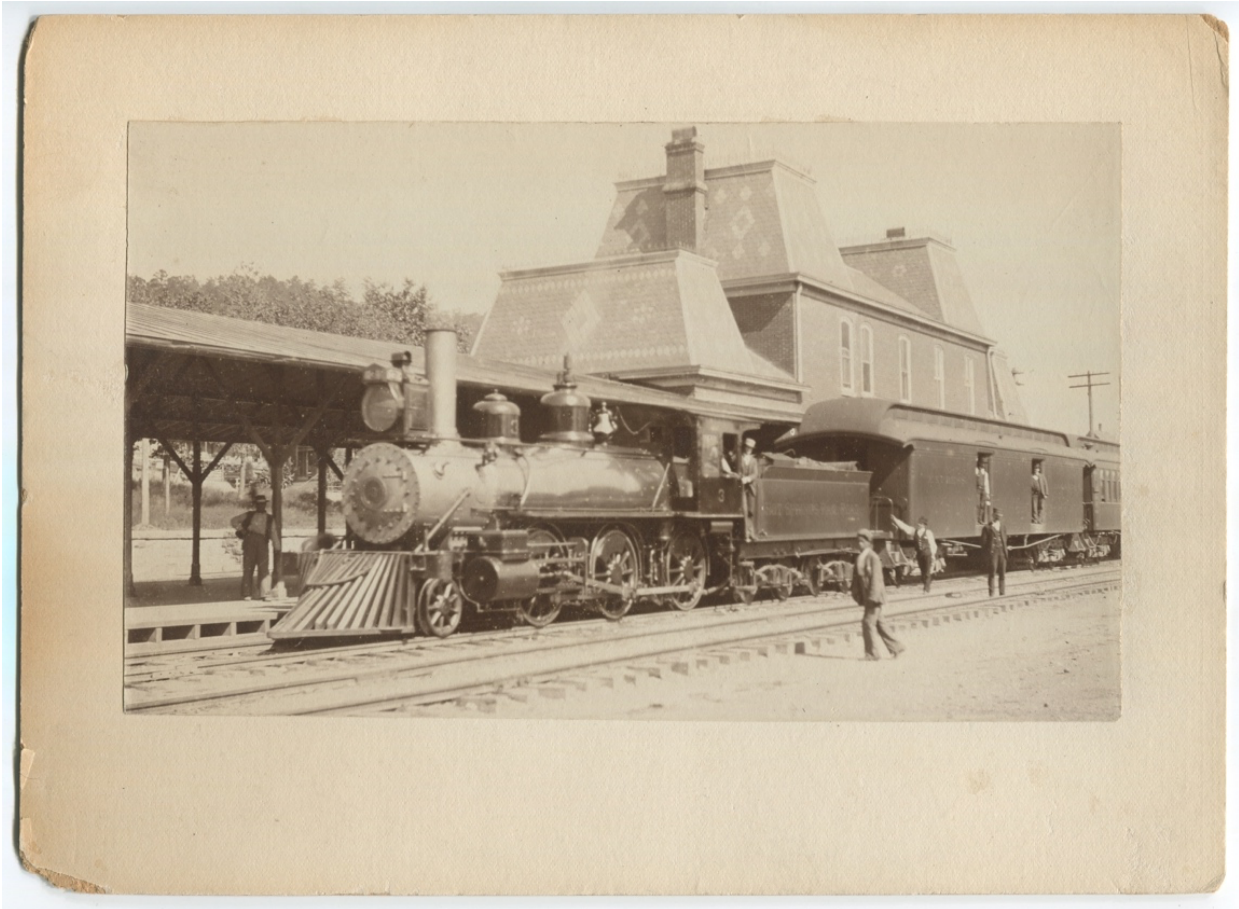
Photo 1: Train at railroad station with passengers and workers onboard, Hot Springs, ca. 1893