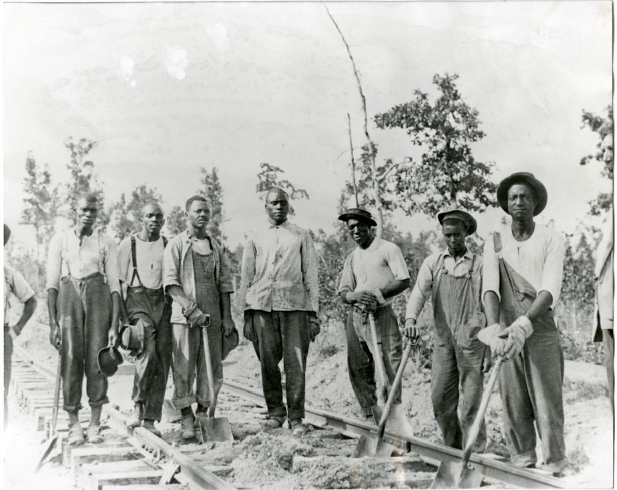
Photo 2: Unidentified railroad crew in Ashley County, Arkansas, not dated/ca. early 1900s (Ashley County Scenes Photograph Collection, ca. 1900-1979)

CENTER FOR ARKANSAS HISTORY AND CULTURE UNIVERSITY OF ARKANSAS AT LITTLE ROCK