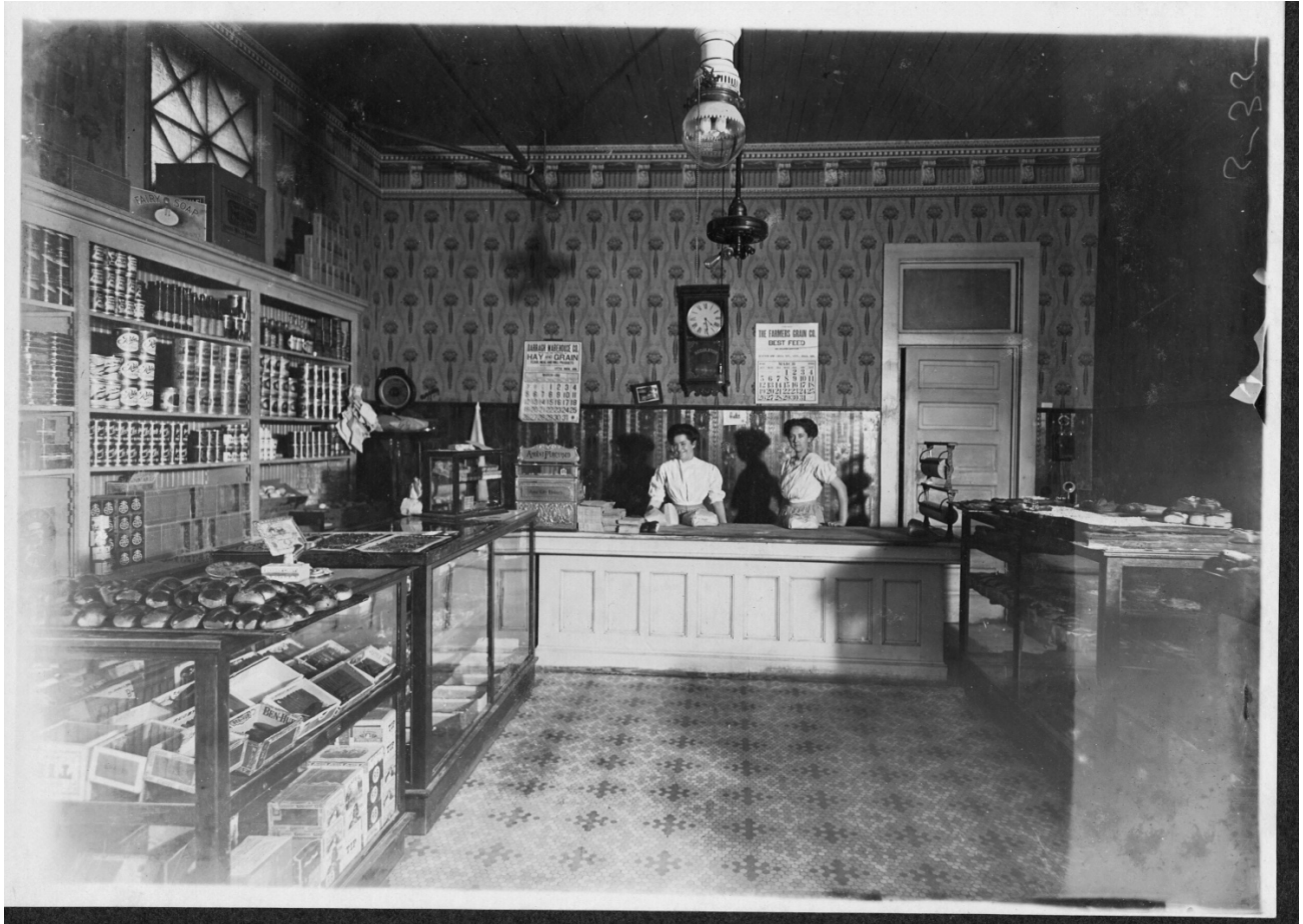
Photo 1: Hills Bakery interior in Little Rock, ca. 1900 (Little Rock Scenes II photograph collection, ca. 1861-1970s)