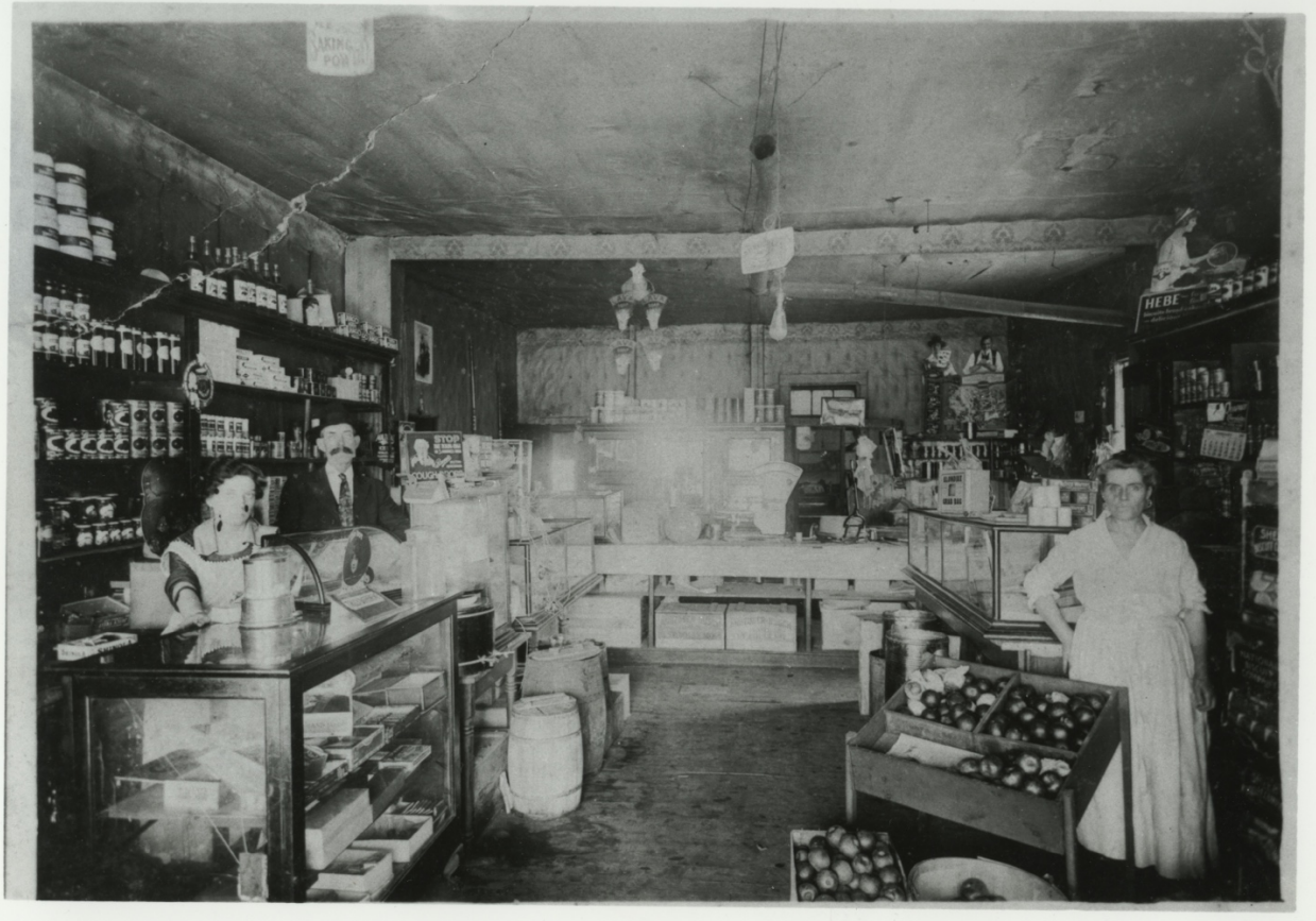
Photo 6: Grocery store in Arkansas, 1917 (Business and Industry photograph collection, ca. 1860s-1970s)

CENTER FOR ARKANSAS HISTORY AND CULTURE UNIVERSITY OF ARKANSAS AT LITTLE ROCK