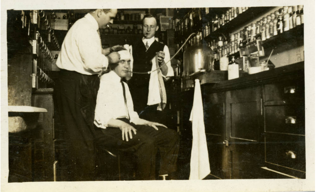
Photo 3: Workers treat a customer inside a pharmacy in Little Rock, ca. 1912-1913

CENTER FOR ARKANSAS HISTORY AND CULTURE UNIVERSITY OF ARKANSAS AT LITTLE ROCK