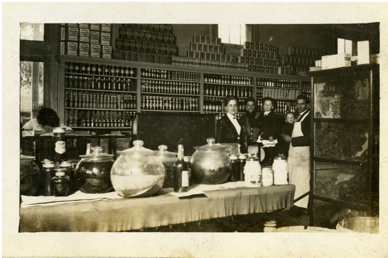
Photo 4: Workers and children pose together at an unidentified grocery store in Little Rock, ca. 1912-1913

CENTER FOR ARKANSAS HISTORY AND CULTURE UNIVERSITY OF ARKANSAS AT LITTLE ROCK