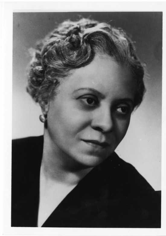
Photo 8: Florence Smith Price (1888-1953). She was the first female African American composer in the United States whose work was performed by a symphony orchestra, not dated (African Americans photograph collection, ca. 1890-1954)