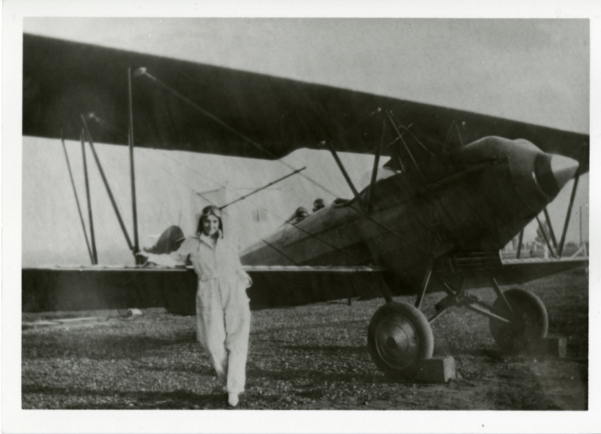
Photo 5: Helon H. Arlitt, first female pilot in Jefferson County and one of the earliest in the state, ca. 1920 (Women in Arkansas, ca. 1850s-1980s)

CENTER FOR ARKANSAS HISTORY AND CULTURE UNIVERSITY OF ARKANSAS AT LITTLE ROCK