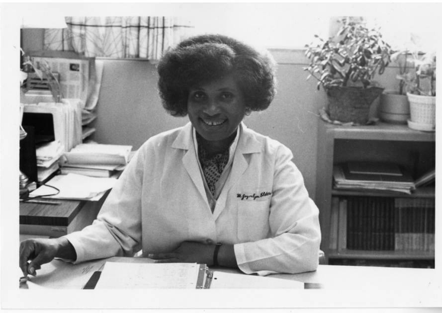
Photo 10: Dr. Joycelyn Elders (b. 1933), pediatrician and public health administrator. She is the second woman, second person of color, and first African American to serve as Surgeon General of the United States, ca. 1980