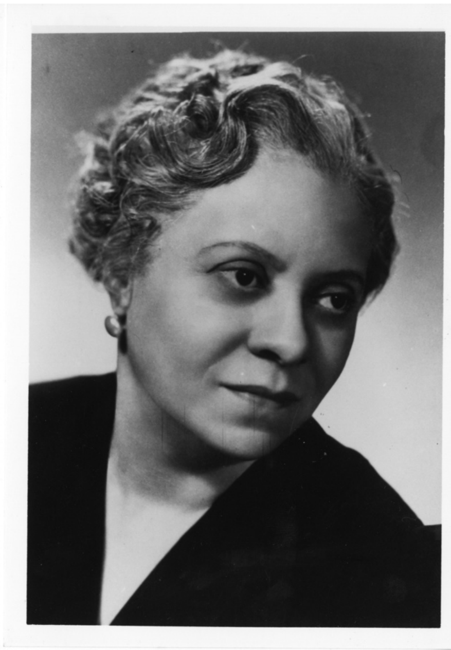
Photo 3: Florence Smith Price (1888-1953). She was the first female African American composer in the United States whose work was performed by a symphony orchestra, not dated

CENTER FOR ARKANSAS HISTORY AND CULTURE UNIVERSITY OF ARKANSAS AT LITTLE ROCK