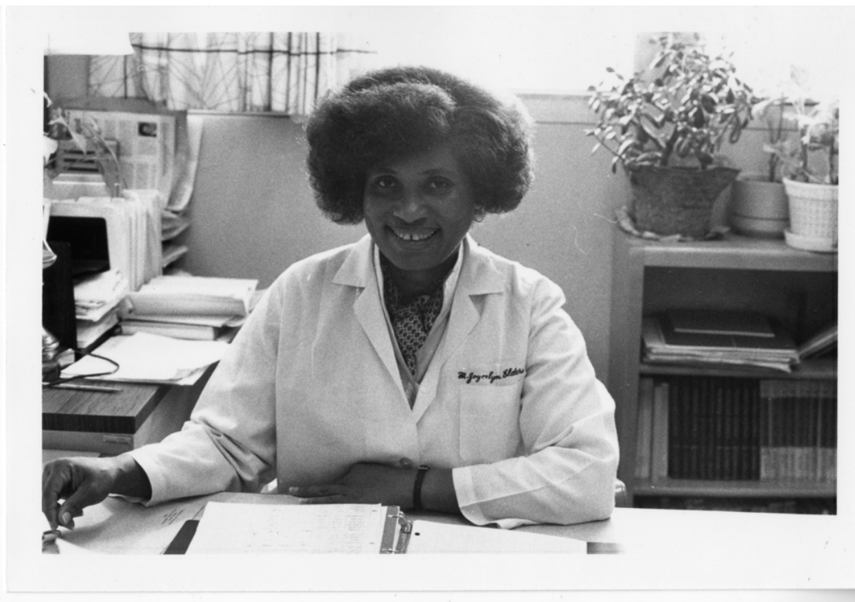
Photo 5: Dr. Joycelyn Elders (b. 1933), pediatrician and public health administrator. She is the second woman, second person of color, and first African American to serve as Surgeon General of the United States, ca. 1980 (Horizons: 100 Arkansas Women of Achievement Records, 1980)

CENTER FOR ARKANSAS HISTORY AND CULTURE UNIVERSITY OF ARKANSAS AT LITTLE ROCK