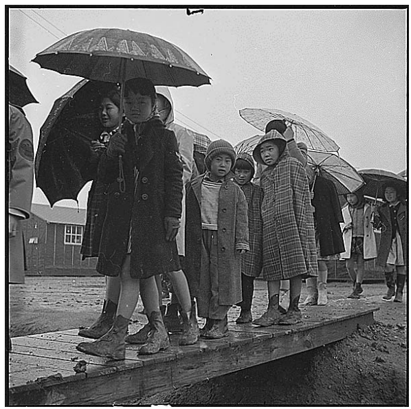
School children leaving the grade school at Jerome... 3/12/1943.