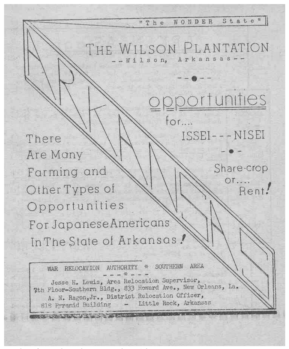
Brochure from Wilson Plantation, Wilson, Arkansas