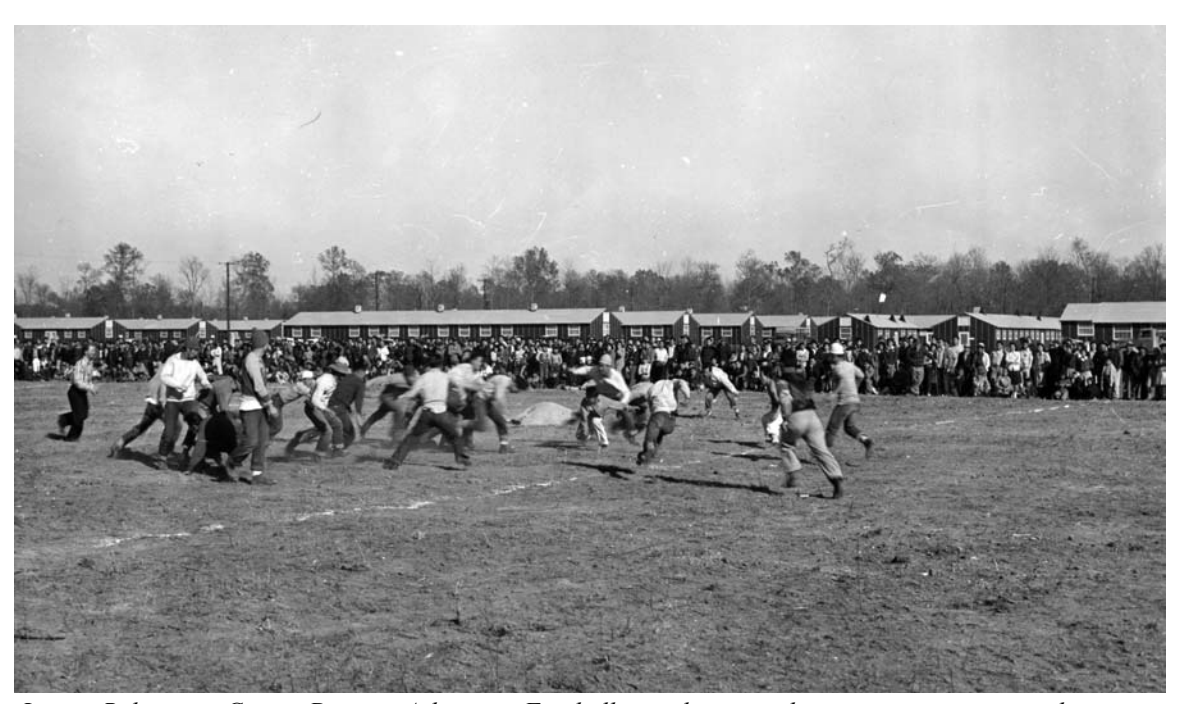
Jerome Relocation Center, Denson, Arkansas. Football crowd at game between group teams at this center. 11/29/1942.