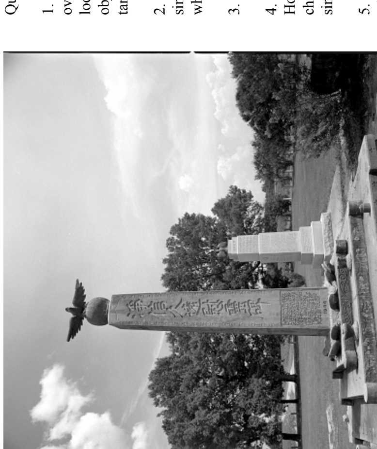
Rohwer Cemetery Now: Courtesy of Drew Harris. Photo by Drew Harris