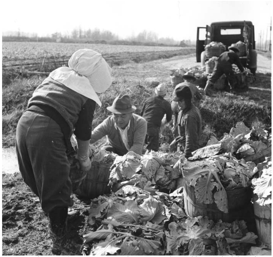
Jerome Relocation Center, Denson, Arkansas. Loading cabbages which have been harvested during the winter season.