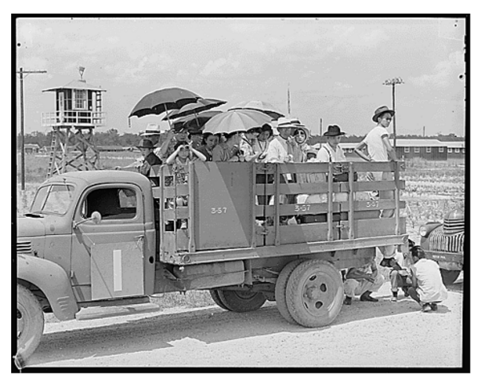
Closing of the Jerome Relocation Center, Denson, Arkansas. "Here we go agian!" A typical truck load of Japanese American residents of the Jerome Relocation Center await at the camp's entrance to be loaded on a train and moved... This is the third move for these people since they were compelled to leave their homes on the west coast. It is the where and when and how of the next move that occupies their thoughts and is constantly reflected in their faces.6/18/1944.