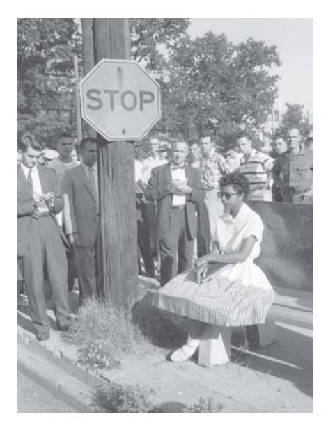
Elizabeth Eckford waiting for the bus on the morning of September 4, 1957 while an angry mob surrounds her. Top photo: Governor Orval Faubus, 1957.

Local business leaders, who had called for peaceful compliance with court orders for school integration, were met with resistance. For instance, the Mother's League sought through the court system to have the federal troops removed from Central High School on the grounds that it violated federal and state constitutions (the action was dismissed) and Governor Faubus issued statements expressing his desire that the nine students be removed from the school. Religious congregations of all faiths gathered to pray for a peaceful end to the conflict and the NAACP fought the validity of the Sovereignty Commission and the forced registration of certain membership lists and organizations. One of those fined for not registering as a member of the NAACP was Daisy Bates, mentor to the nine students, who was fined $100 for not complying with the State Sovereignty Commission regulations.